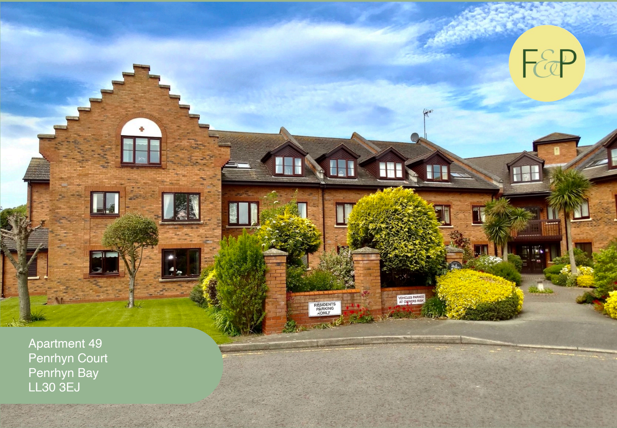
Apartment 49 Penrhyn Court Penrhyn Bay LL30 3EJ